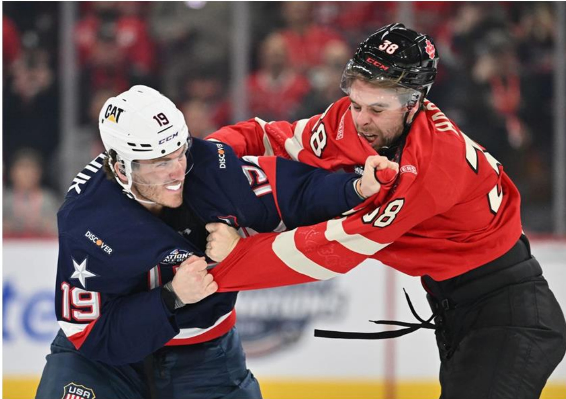
Matthew Tkachuk of Team USA fights with Brandon Hagel of Team Canada during a game Saturday.